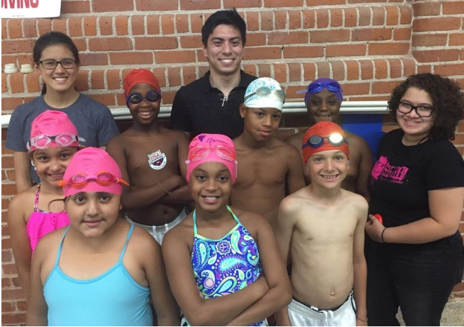
Some LEAP swim team members and coaches.

With support from the USA Swimming Foundation, LEAP ran a seven-week competitive community swim team this summer for children ages 6 to 15. We spent the Spring semester teaching local teenagers to be swim coaches under the guidance of an experienced coach and these young people led our new team six days a week. LEAP's hope is that we will be able to build a year round swim team so that children from New Haven neighborhoods can experience the fun and challenge involved in competitive swimming. We are looking for sponsors and donors who are interested in supporting the development of this team. Congrats to all of the children, parents and coaches who participated.